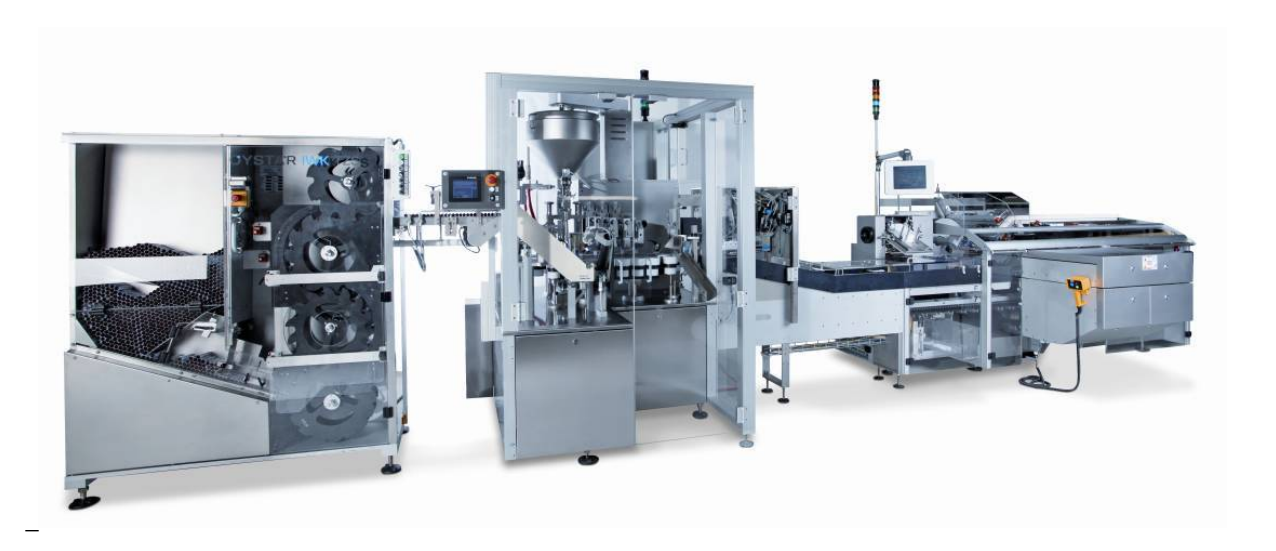
Picture 1 The FP 18-1 tube filler from OYSTAR IWK – shown with tube magazine and cartoner – is the company's first machine to be equipped with a PacDrive 3-based automation solution