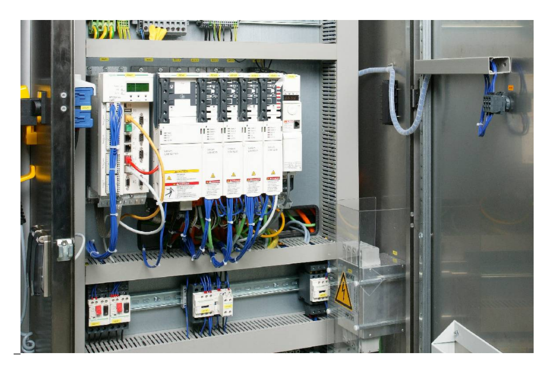
Picture 3 View of the machine's rear-mounted control cabinet: The PacDrive 3-based automation solution with the new Lexium LXM 62 multiaxis servo system